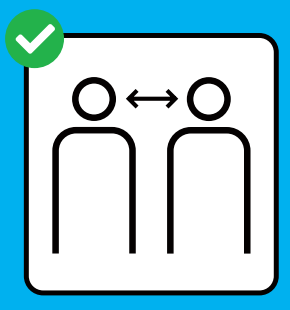
Keep your distance.