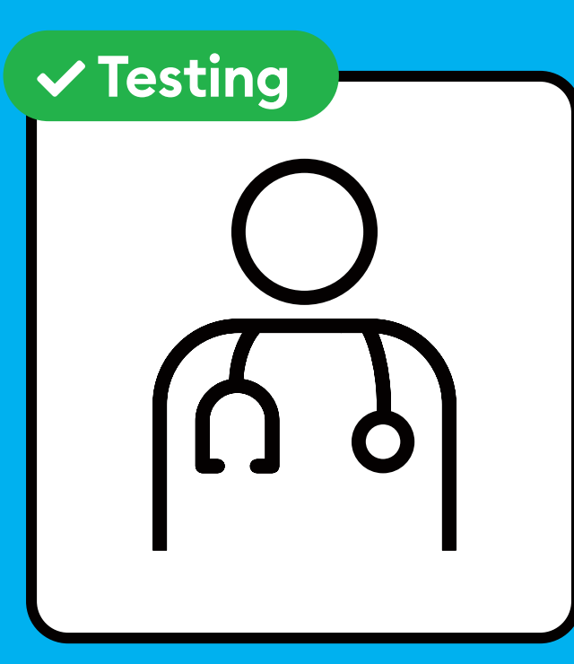
If you experience symptoms, get tested immediately and stay at home.